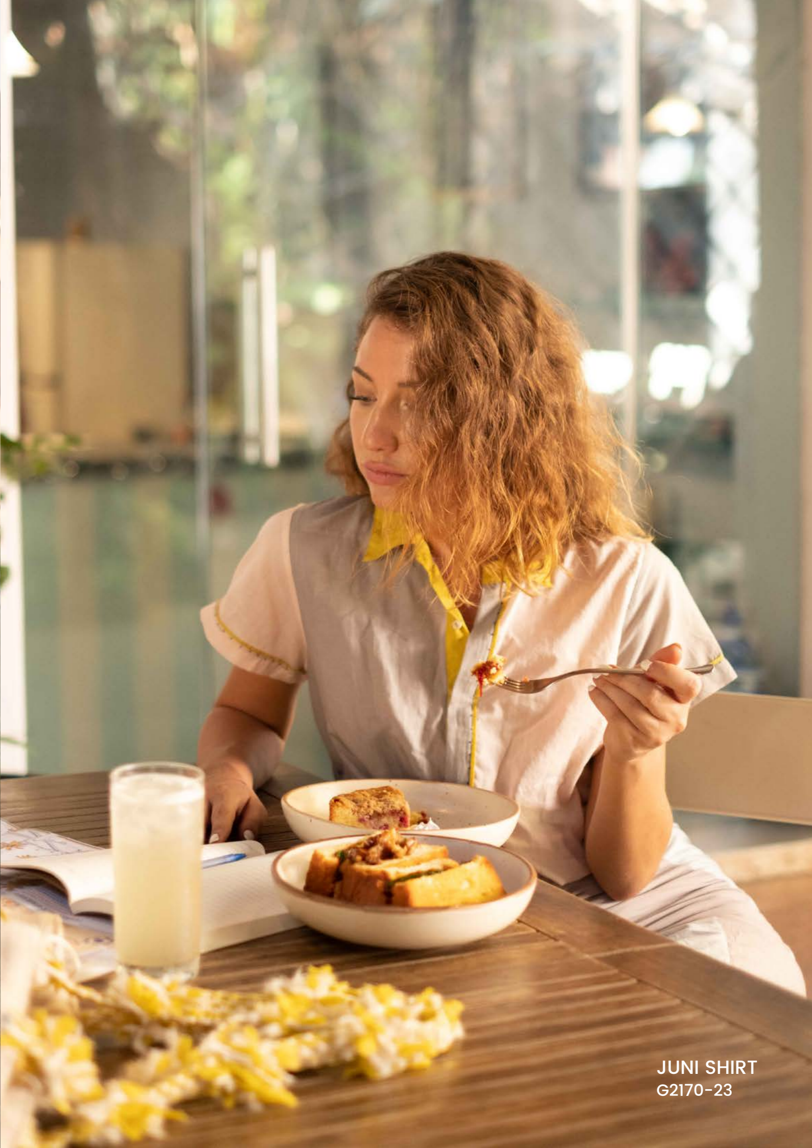
JUNI SHIRT G2170-23