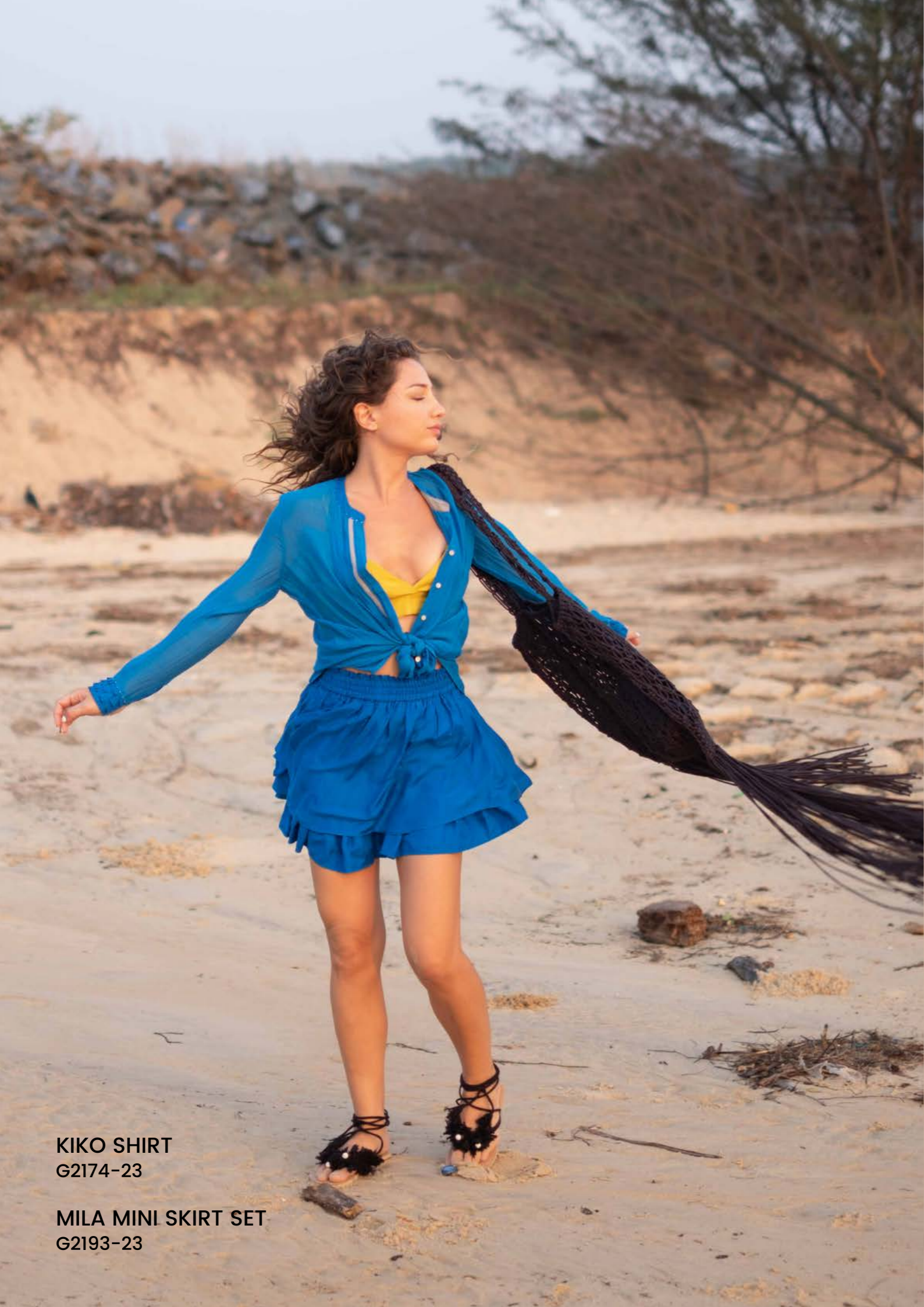
KIKO SHIRT G2174-23