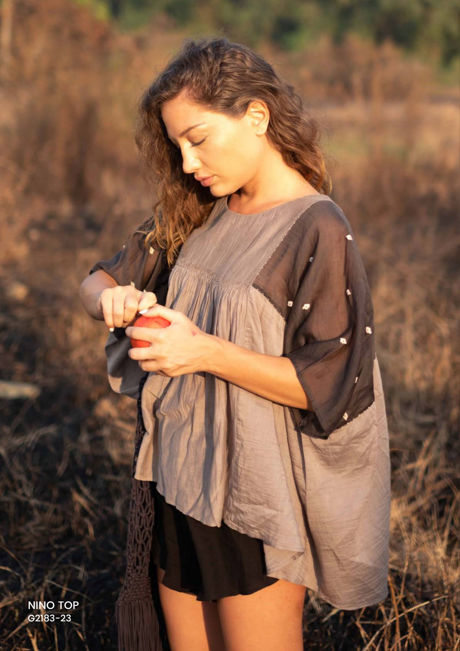
NINO TOP G2183-23