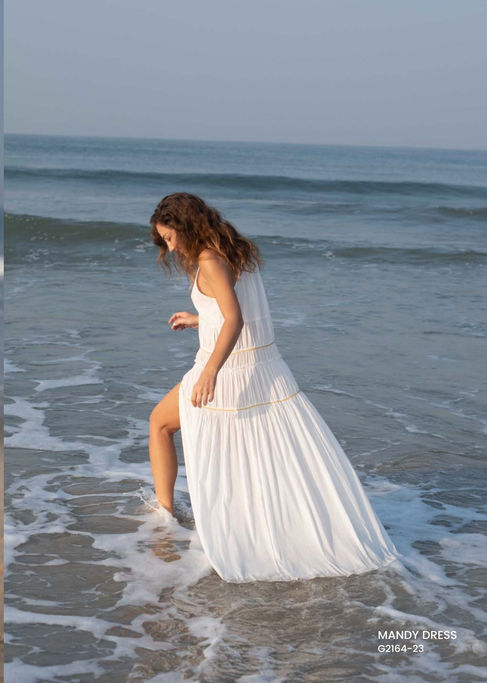
MANDY DRESS G2164-23