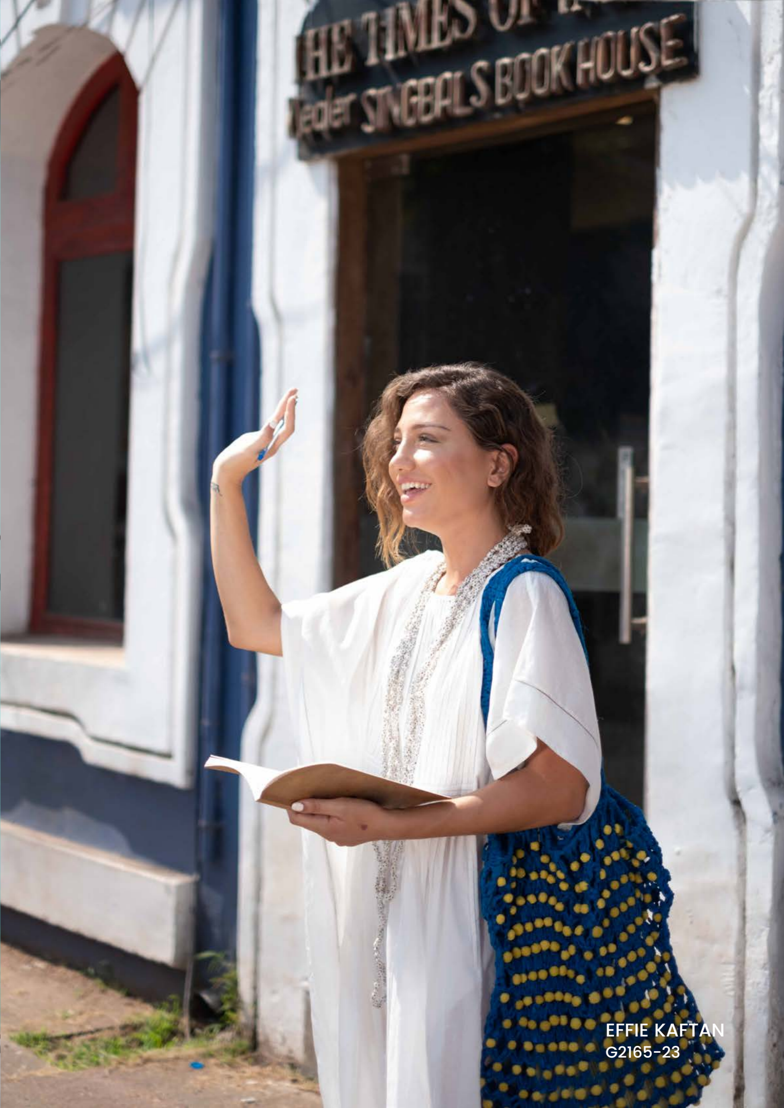
EFFIE KAFTAN G2165-23