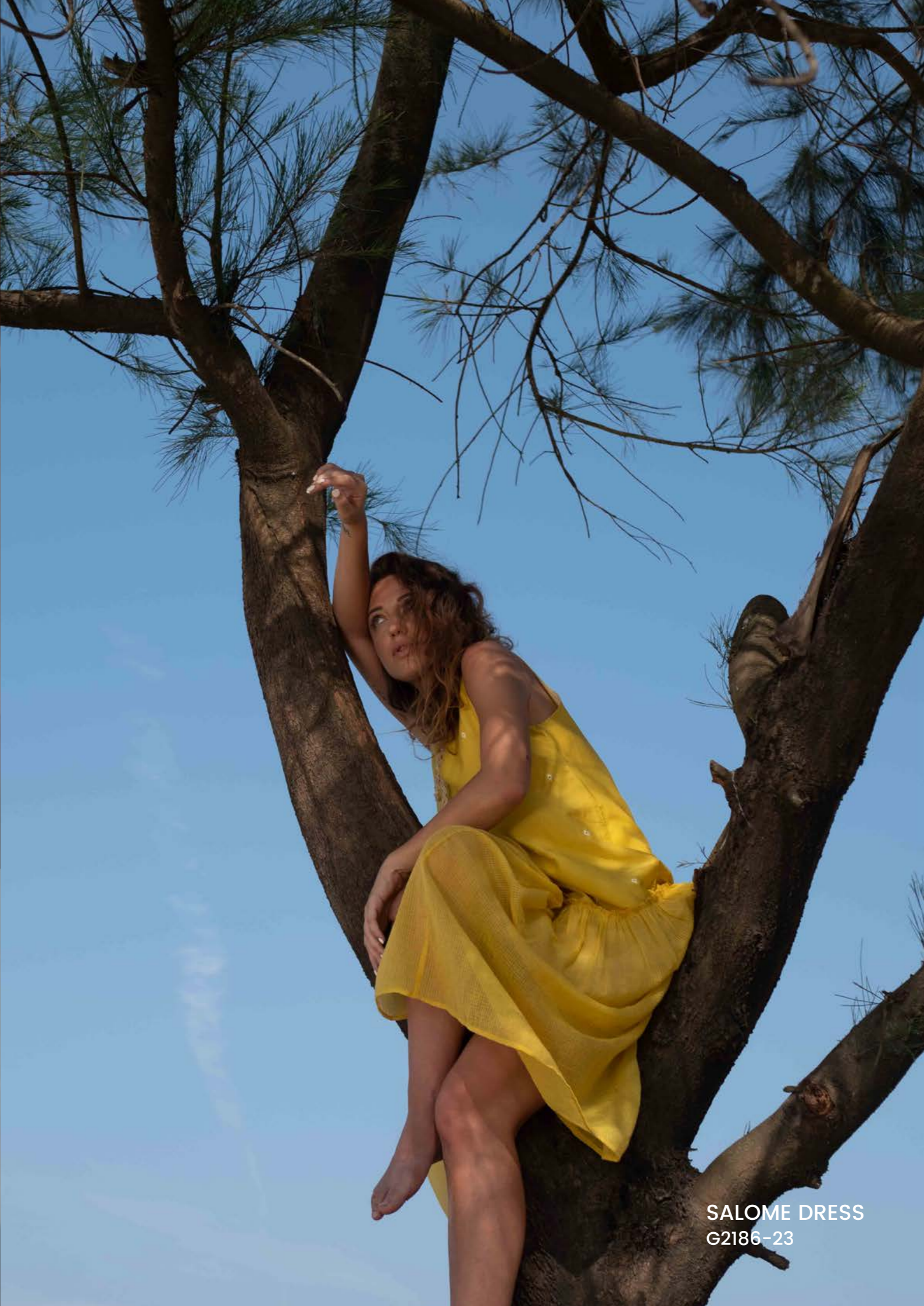
SALOME DRESS G2186-23