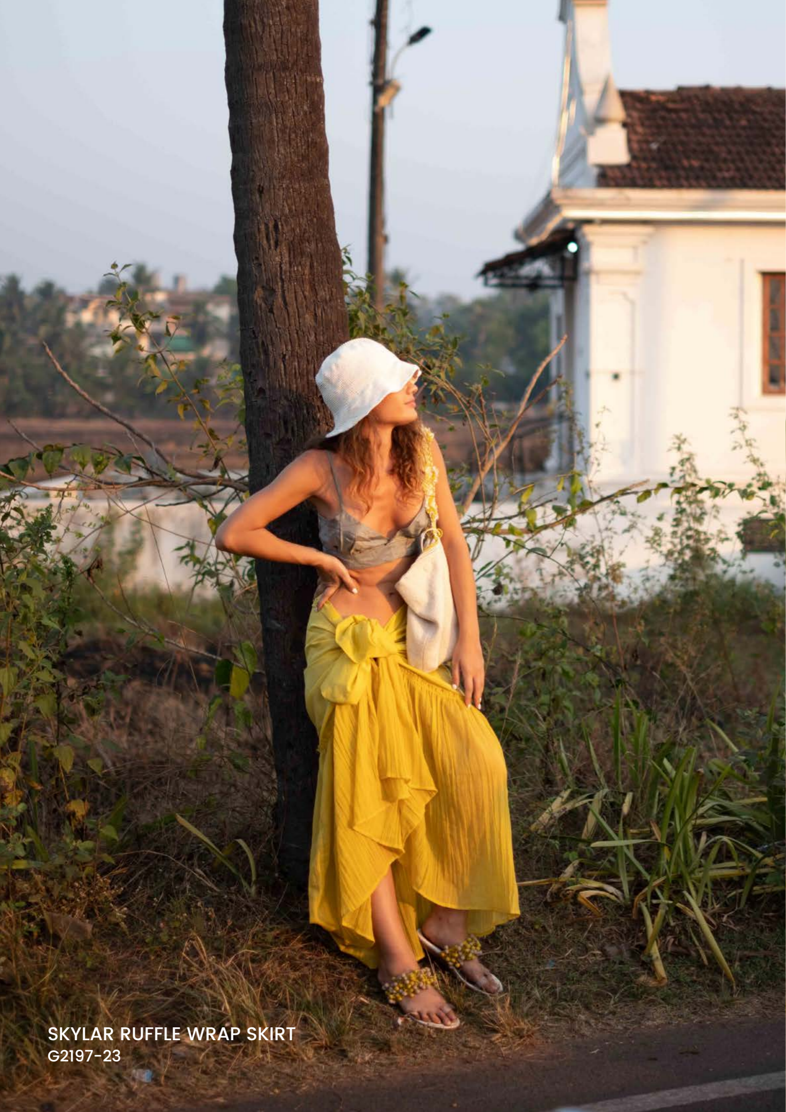
SKYLAR RUFFLE WRAP SKIRT G2197-23