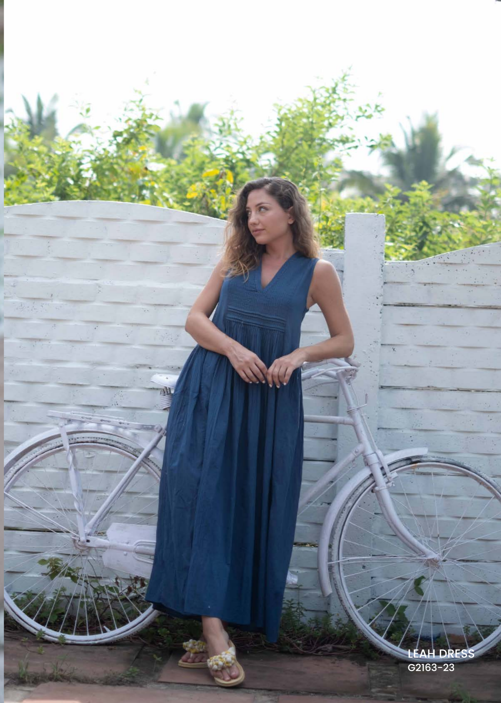
LEAH DRESS G2163-23