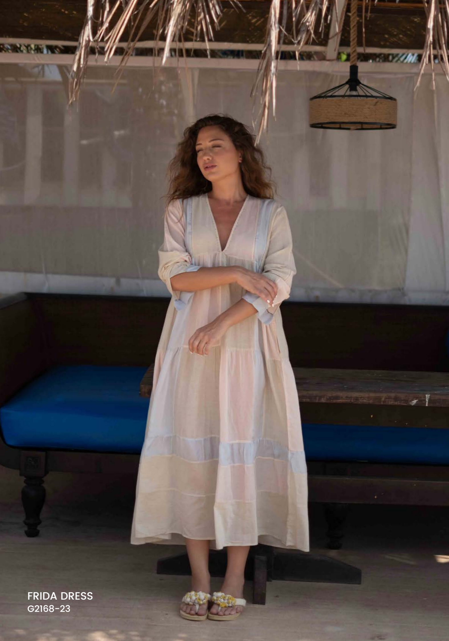
FRIDA DRESS G2168-23