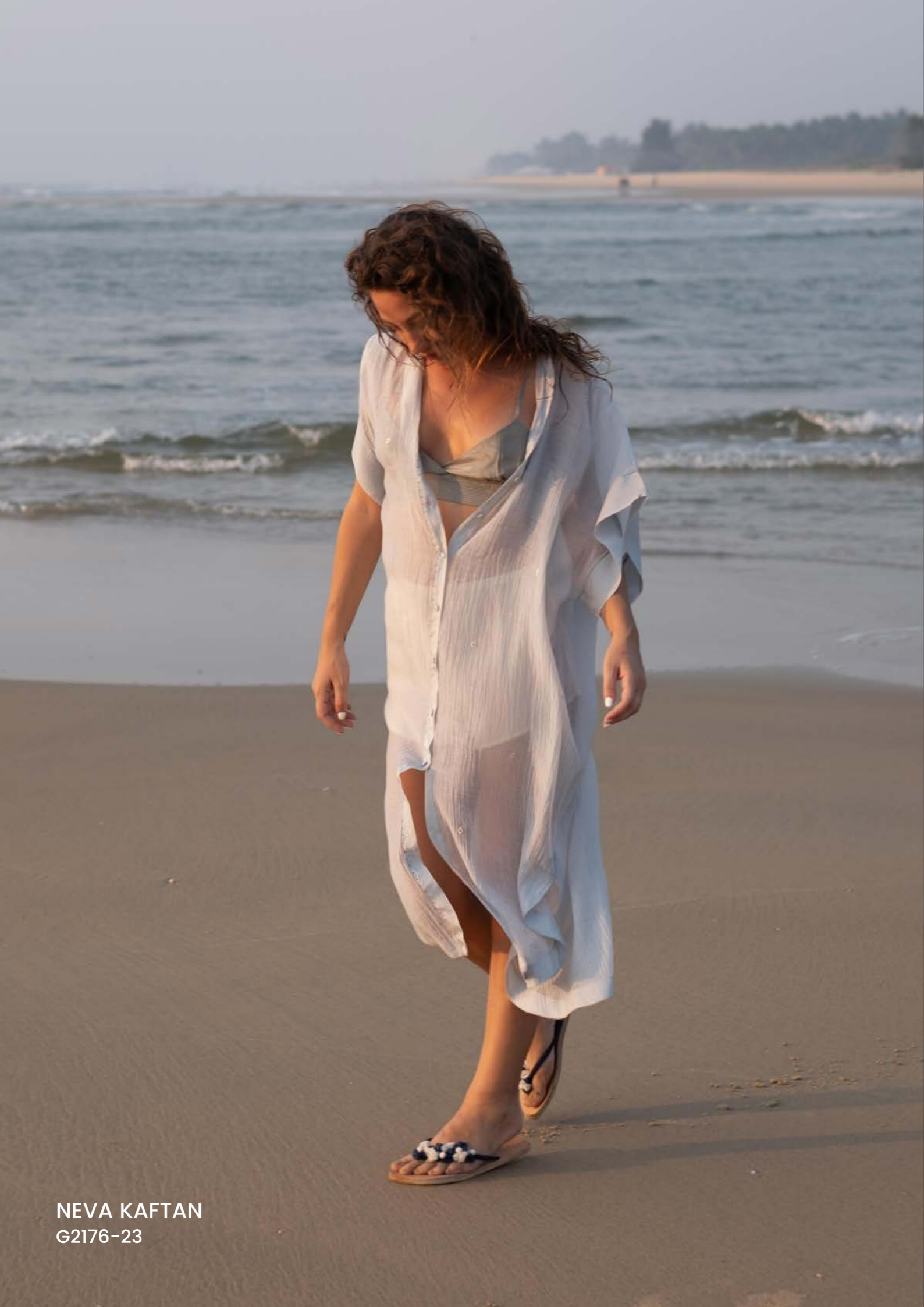
NEVA KAFTAN G2176-23